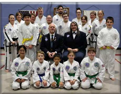
Testing Group—December 2025