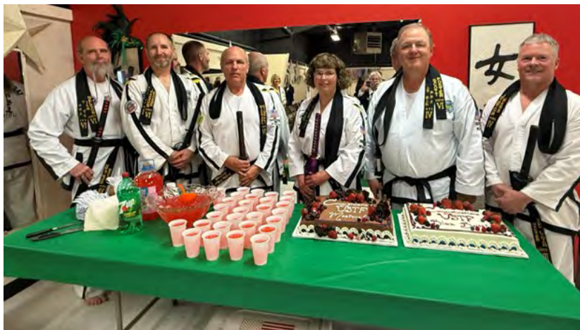
The newest Master instructors in the USTF