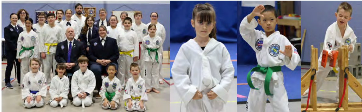
March 2026 Testing Group