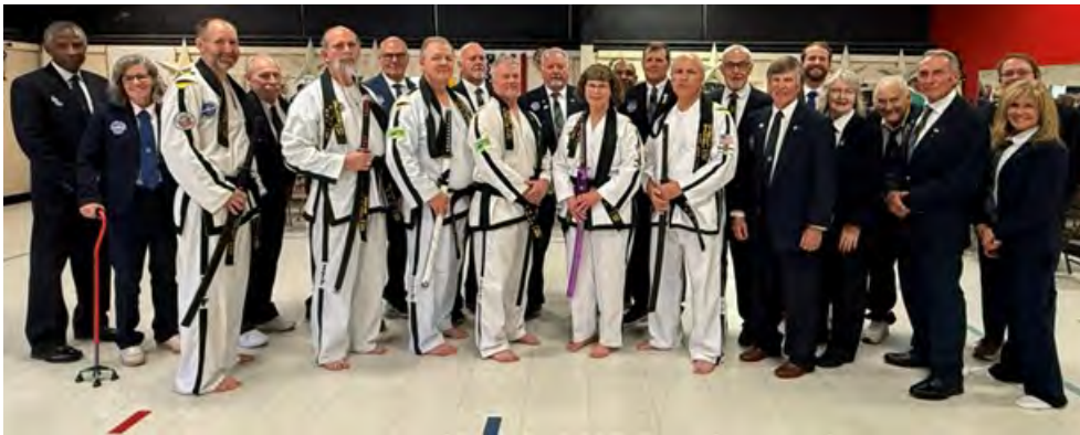
Group picture of all Grand Master, Sr. Master, and Master instructors at the testing

The testing featured strong representation from multiple schools including Sereff Taekwon-Do, Maestas Taekwon-Do, DeBaca Taekwon-Do, and Senatobia Taekwon-Do. Support also came from Grand Masters, Senior Masters, and Masters traveling from Colorado, Wyoming, Nebraska, Mississippi, and Utah, highlighting excellent support of the USTF. Congratulations to all that successfully completed their grading.